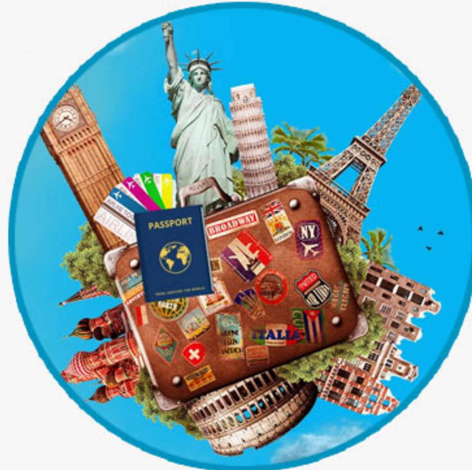
WORLDWIDE TOURIST VISA