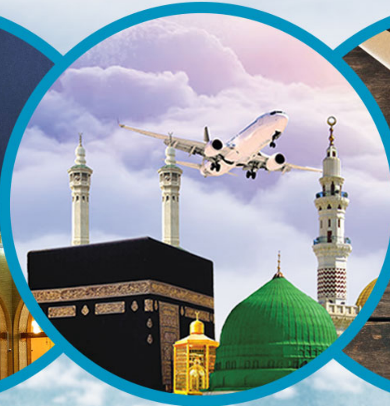
HAJJ UMRAH PACKAGES