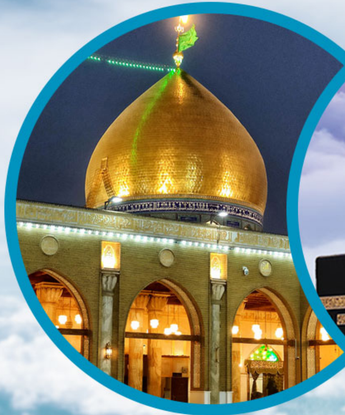
IRAN IRAQ ZIYARAT